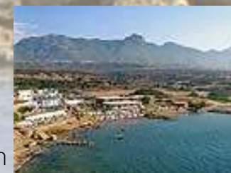
Vogue Beach Club