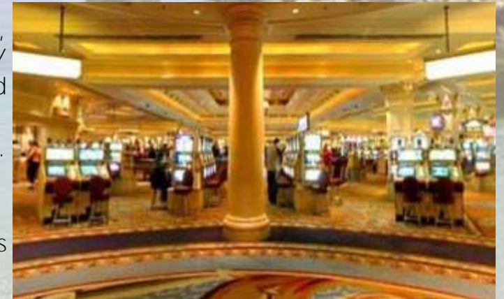
Jasmin Court Hotel

The Rotary Club of Kyrenia meets every Wednesday at The Dome Hotel at 13:00 for lunch from October till May and then at 19:00 from June to September for drinks. Visiting Rotarians are always welcome.